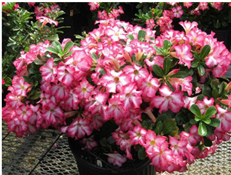
Adenium obesum 'Blooming Fool' in full flower growing in a 10-inch pot.

Desert rose ( Adenium obesum ) and its many hybrids are often seen in retail garden centers. Flowers average 2–3 inches in diameter and may be single, double, or even triple. To maintain the profuse flowering, the plants must six hours or more of bright light each day. Desert rose makes a dramatic specimen for a deck or patio but since it's sensitive to temperatures below 40 degrees, it's usually grown in containers that can be brought inside for winter. South Florida gardeners can grow this as a small shrub.