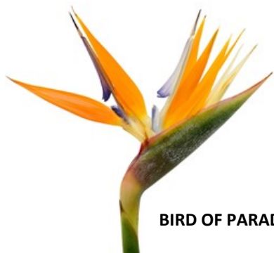
BIRD OF PARADISE

For more information, please visit GardeningSolutions.ifas.ufl.edu